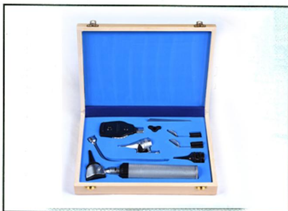
Diagnostic Sets A-034-000