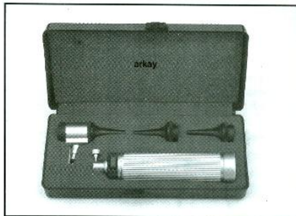
Diagnostic Sets A-025-000