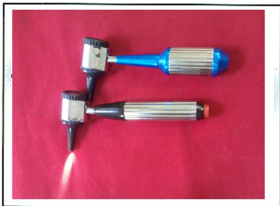
Fiber Optic otoscope (1 Touch System) A-035-000

Estuches de diagnostico con Iluminacion standard Combinazioni per diagnostica con illuminazione standard