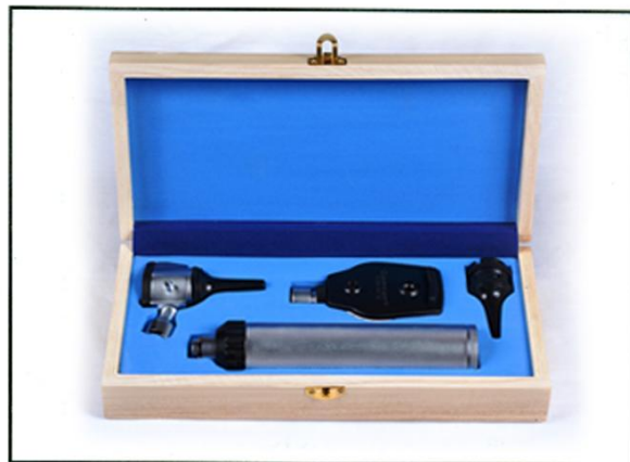
Diagnostic Sets A-036-000