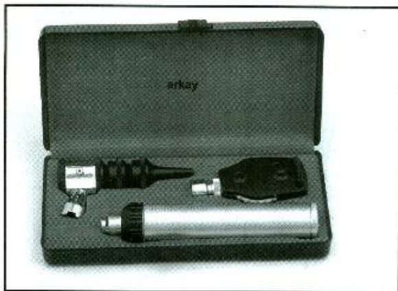
Diagnostic Sets A-026-000