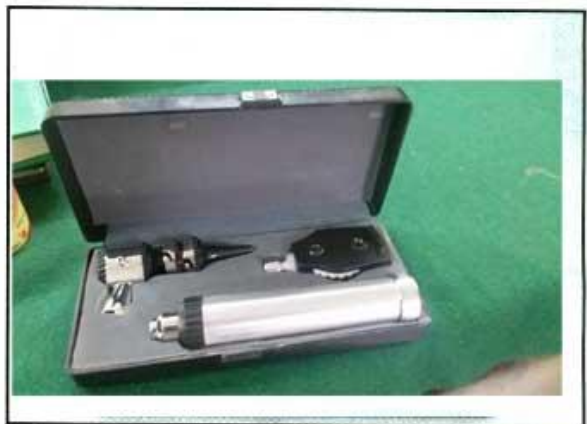
Diagnostic Sets A-034-000