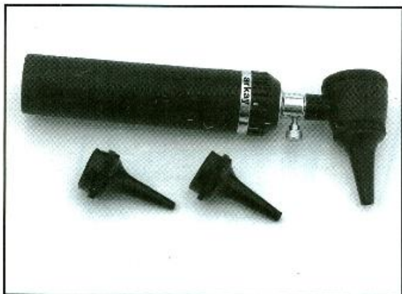
Diagnostic Sets A-024-000

Estuches de diagnostico con Iluminacion standard Combinazioni per diagnostica con illuminazione standard