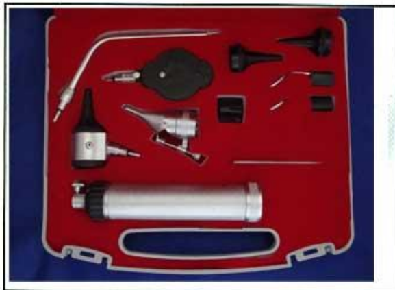
Diagnostic Sets A-031-000

Estuches de diagnostico con Iluminacion standard Combinazioni per diagnostica con illuminazione standard