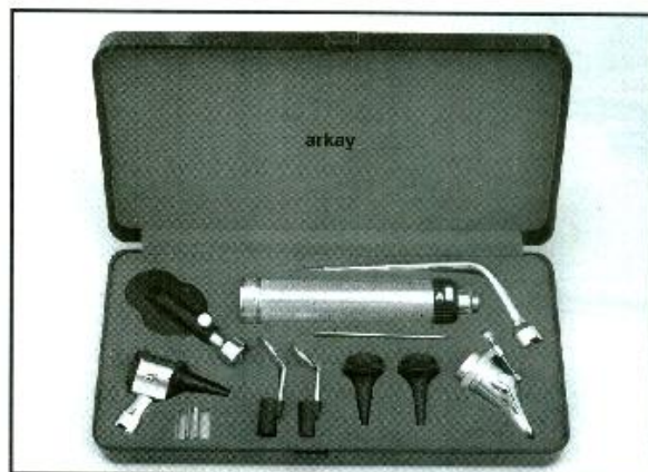
Diagnostic Sets A-027-000