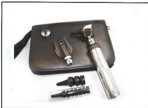
Diagnostic Sets A-033-000