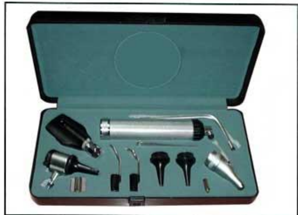
Diagnostic Sets A-032-000